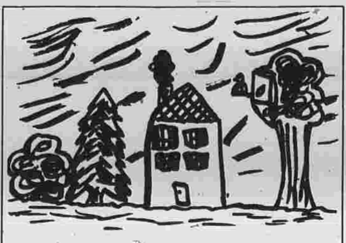
The damp clamps down

Across the nation: Rain will be scattered over the Atlantic Coast states, the upper Ohio Valley, the lower Great Lakes and along the northern Pacific Coast.