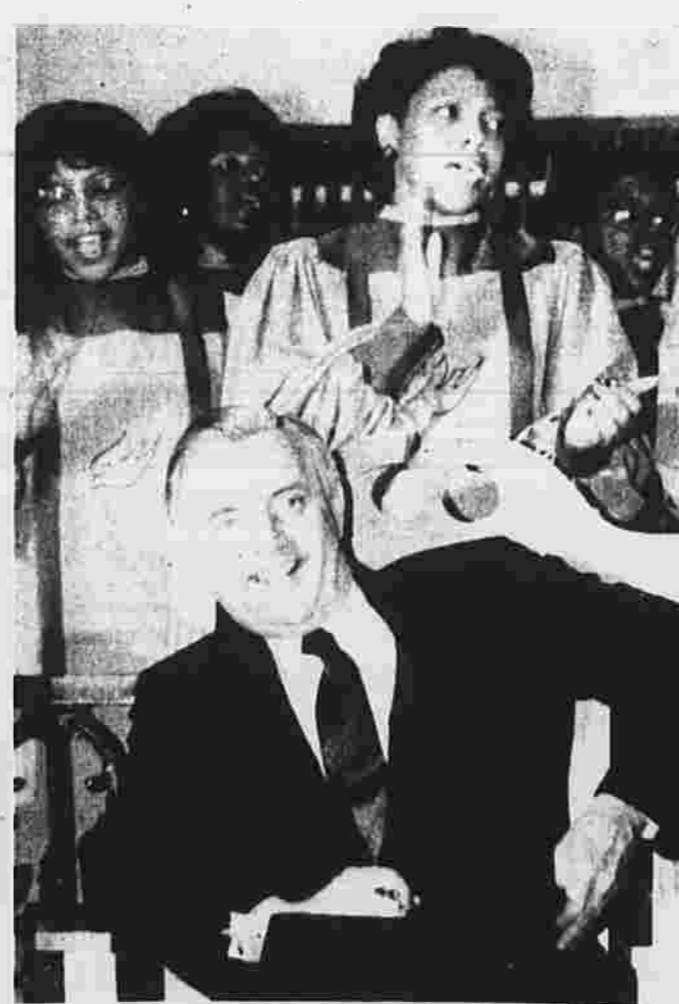
Democratic presidential candidate Walter Mondale wears a broad smile Sunday as he listens to the church choir during a campaign stop the Monumental Baptist Church in Memphis, Tenn.

The NFL responded by suing and then voting immediately to block the move. After one mistrial, a second jury ruled in favor of the Raiders, finding that league rules violated antitrust laws.