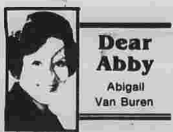
Dear Abby Abigail Van Buren

DEAR ABBY: I have a problem. A very big one. For three years I was tormented by a Jewish ghost who thought I was his wife. I moved into the apartment where he and his wife once lived. They both died, but he kept coming back to the apartment to be near her.