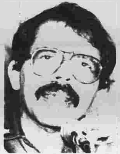
DANIEL ORTEGA only taken opposition